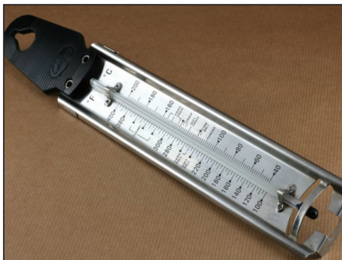
Figure 16. Candy thermometer

evaporation process is then continued with no additional sap and the entire batch is “finished” to the desired density.