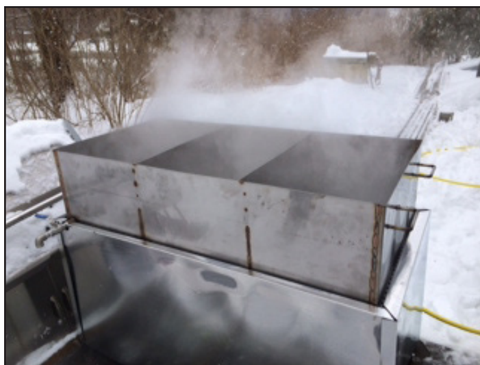
Figure 14. Boiling sap.