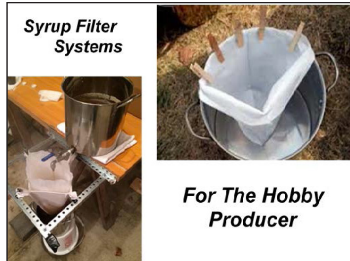
Figure 18. Systems for filtering sap

Another useful tool is a hydrometer (Figure 17). This instrument is used to measure the density of syrup. There are two scales: one for hot syrup and one for cold. The hydrometer will suspend in a cup or pail of hot syrup. When the top line is even with syrup level in the cup of hot syrup (211 degrees Fahrenheit), it will be 66°Brix or 66 percent sugar. You must be at or over 211 degrees Fahrenheit to get an accurate reading. Legal syrup at 66°Brix is properly finished. You can also cold test your syrup at room temperature (70 degrees F).