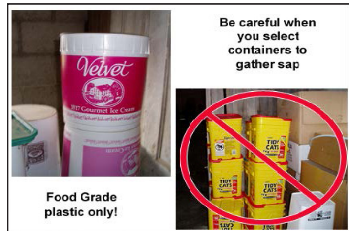
Figure 8. Use food grade containers only

You may already have some of the items needed for this endeavor on hand, or you can buy them at a local store. Others—such as metal and plastic collecting spouts (called spiles), a hydrometer, collecting buckets or bags and finishing filters—are unique to maple production (Table 1). Depending on the item, it might be made, purchased second hand from a maple producer, or purchased from a maple equipment supplier. Check with your county Ohio State University Extension office, ODNR Division of Forestry Service Forestry office, or a local maple producer for the names of suppliers.