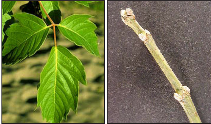
Figure 3. Boxelder leaf and bud