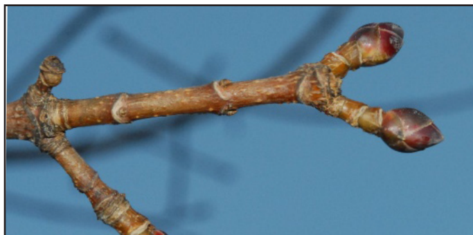
Figure 7. Norway maple leaf and bud

All of these maple species can be used to produce syrup. With sugar maple, it takes about 43 gallons of sap to produce 1 gallon of syrup. The lower the sugar content of the sap, the more gallons of sap that are needed to produce a gallon of syrup. Also, the lower the sugar content, the more fuel and time it will take to boil down the sap. Today, commercial producers can use technology to shorten this boil time. A reverse osmosis machine removes 75 percent of the sap’s water content before the boiling process even starts.