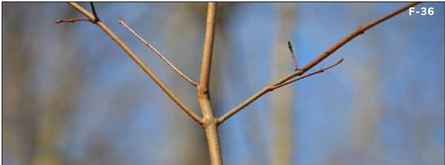
Figure 1. Opposite branching of sugar maple