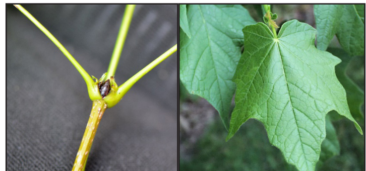
Figure 2. Black maple bud and leaf

The maples belong to a small category of deciduous trees that are "opposite"—opposite branching, leaves attached and buds are opposite (Figure 1). To identify your trees, start when the leaves are on the tree as it is a much easier. Below is a synopsis of characteristics for each of the native maples found in Ohio.