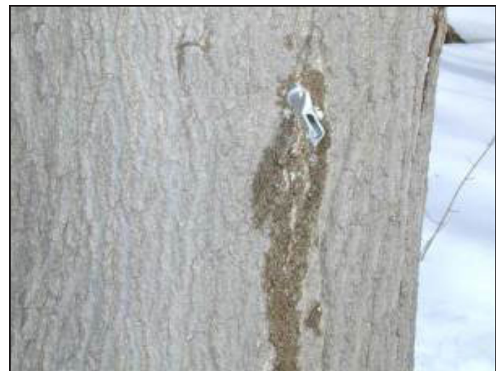
Figure 13. Leaking spout

blocks of ice to cool the sap. These can be made from water or they can be made of frozen sap. Old chest freezers work well to store containers of sap, and they make a great place to store equipment in the off season.