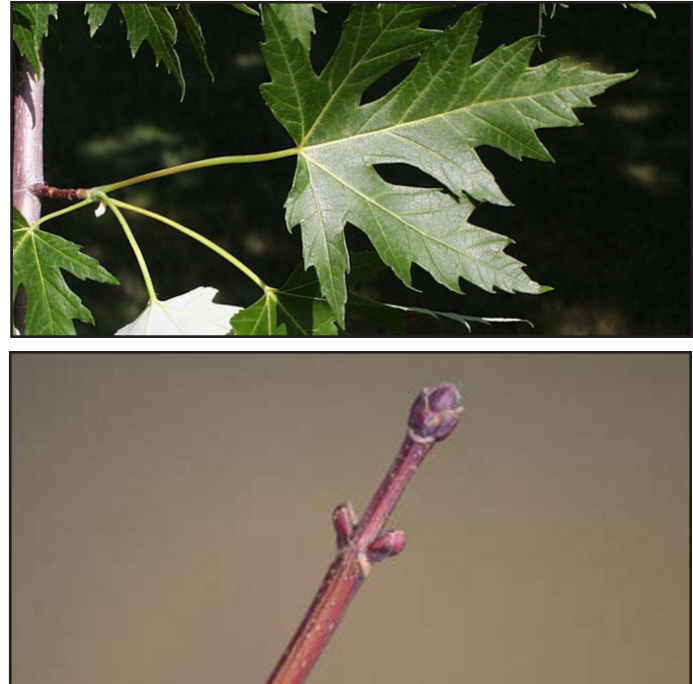
Figure 5. Silver maple leaf and bud