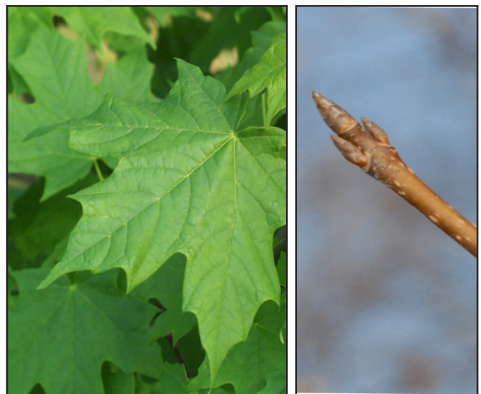
Figure 6. Sugar maple leaf and bud