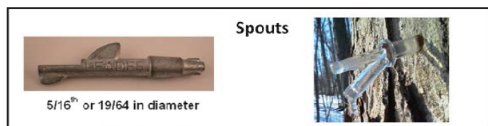
Figure 9. Types of spouts

To get the sap from the tree you will need a spout (Figure 9). You will want to buy a new 5/16 spout made of metal or plastic. The smaller diameter will allow the tap hole to quickly heal over allowing the wound to heal when the spout is removed. If you decide to use plastic, make sure it is sturdy enough to support a bucket or bag that is full of sap (around 20 pounds). If you are going to place a bucket on the ground below the spout, you can buy a tubing spout and a short length of maple tubing to run from the spout to the bucket. The drill bit you select should be the same diameter as the spout. In most cases, this will be 5/16. Do not oversize or undersize drill bit because it may cause the tap hole to leak sap. You can buy a maple tapping bit for less than $20.00 and it will last you a lifetime. It is sized correctly and is designed to drill straight and clean out the hole.