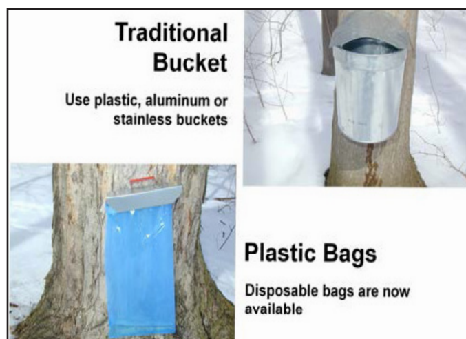
Figure 10. Buckets or plastic bags for collecting sap

When you walk up to the tree, the first thing you need to do is determine the diameter of the tree and its overall general health. You want to make sure that it is at least 10 inches in diameter. The best way to determine this is to measure a piece of rope to 33