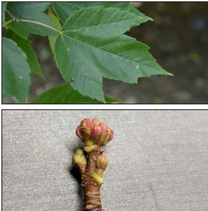
Figure 4. Red maple leaf and bud