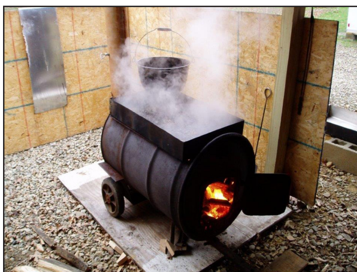
Figure 15. Boiling sap on a barrel stove with a preheating pan until a suitable amount of concentrated sap is present. The