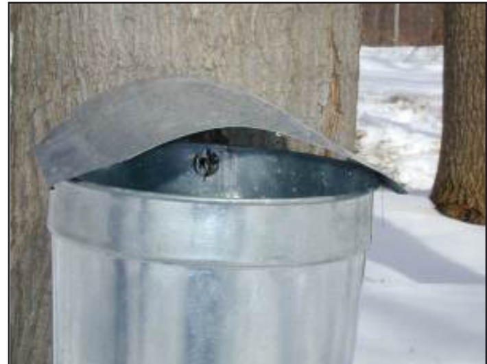
Figure 12. Bucket with cover

To produce high-quality syrup, sap should be collected as quickly as possible. Keep in mind that if the sap warms up, bacteria will colonize and grow. The bacteria will interact with the sugar in the sap, and once heated, the syrup will turn dark. You will need to boil your sap as soon as possible, especially in warm weather. During periods of cold temperature, sap can often be stored for a couple of days under the proper storage conditions without seriously reducing the quality of syrup it will produce. If you store your sap in a tank, it should be in a shady location (perhaps on the shaded side of your house). Place mounds of snow around the tank to keep it cool. In warmer weather, you can add