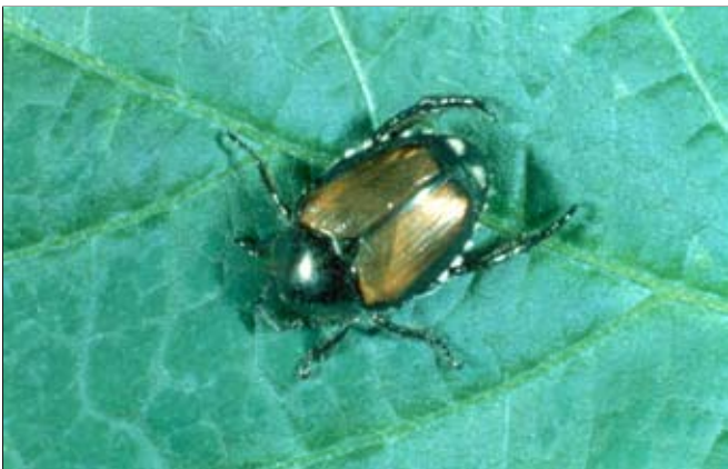
Figure 7. Japanese beetle adult.