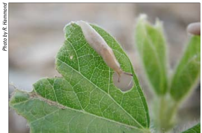
Figure 5. Gray garden slug.

The GGS (fig. 5) is often a problem in soybeans grown using conservation tillage practices, especially no-till. While able to cause significant stand reduction from feeding on germinating plants, GGS can also inflict significant defoliation to young soybean plants (fig. 6). Unlike the other pests discussed, foliar insecticides will have no impact on GGS or other slug species. Management comes from tilling the soil and the burial of crop residues, or the use of molluscicide baits. Growers should see the fact sheet http://ohioline.osu.edu/ent-fact/pdf/0020.pdf for more information on GGS.