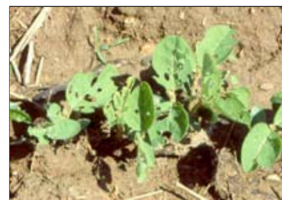
Figure 2. Bean leaf beetle feeding damage on soybeans after emergence.

The BLB is a small beetle that varies in color from golden yellow to red, generally having six black spots on the wing covers, and always having a black triangle on the area centrally behind the thorax (fig. 1). The BLB overwinters in the adult stage, and resumes activity in the spring. It will be found feeding on soybean foliage soon after soybean emergence (fig. 2). The overwintered BLB adults feed on foliage and deposit their eggs in the soil. Unless beetle densities are abnormally high and feeding significant (> 40% leafloss), this early season defoliation is usually not considered economic. If a soybean field is late planted relatively to other