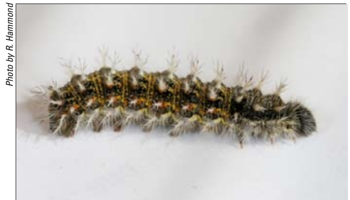
Figure 11. The painted lady, also known as the thistle caterpillar.

Early planted soybeans, relative to other fields in the area, may attract large numbers of overwintering BLB and MBB. Periodic inspection of early planted