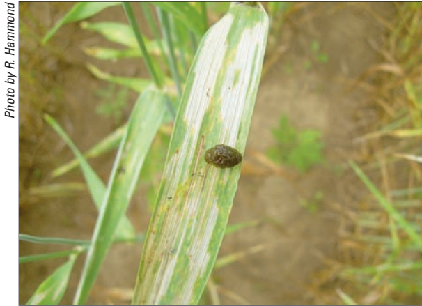
Figure 3. Cereal leaf beetle larvae.