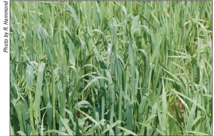
Figure 4. Cereal leaf beetle larval feeding damage.

As the wheat begins to mature, the need for spraying diminishes. The health of the flag leaf is important to maintain good yields and test weights; however, the importance of keeping these plant parts healthy with chemical applications diminishes once grain fill is complete. The extent of the yield loss resulting from defoliation depends largely on when defoliation occurs relative to grain fill, the variety involved, and the weather conditions. Losses resulting from damage to the upper two leaves tend to be highest when defoliation occurs shortly after pollination (which coincides closely with flowering), before grain fill is complete. If defoliation occurs toward the end of grain fill, losses will likely be much lower. If leaves are destroyed at such a late growth stage, sugars will