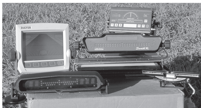
Figure 3. Light bar and visual display.

The controller is used to select menu options in the guidance system. Along with the controller, a data logger, visual display or sound device can be important attributes to a guidance system for custom applicators or producers that need to document when and where a product was applied. Some of the systems have a visual screen along with the data logger to provide a visual representation where the material was applied (Figure 4). Some data loggers can also mark field attributes such as rocks and drainage areas, or save them for future reference. The controller and data logger may be combined into one unit.