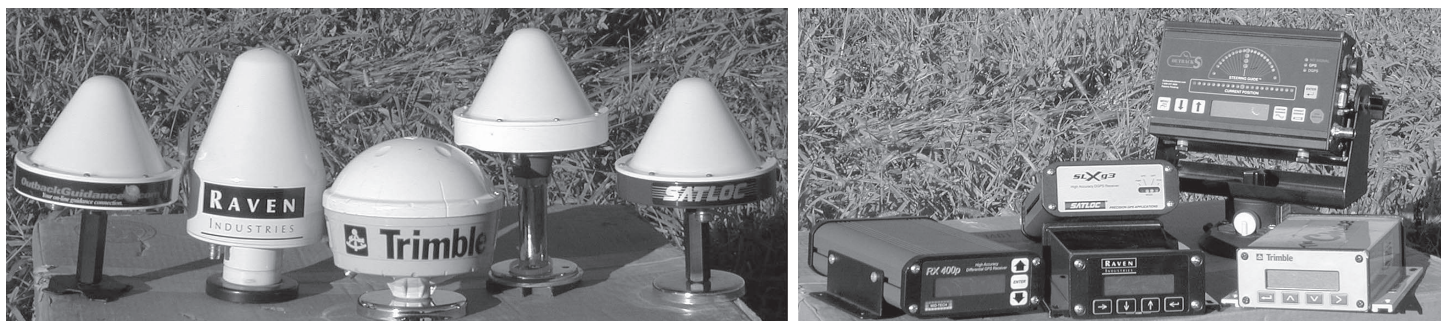
Figure 2. GPS antennas and receivers.

send out the position information five times per second. Most guidance systems need an update rate of 5 Hz to operate effectively. A DGPS receiver with an update rate of 1 Hz may not provide enough data to operate a guidance system effectively due to the speed of information being processed.