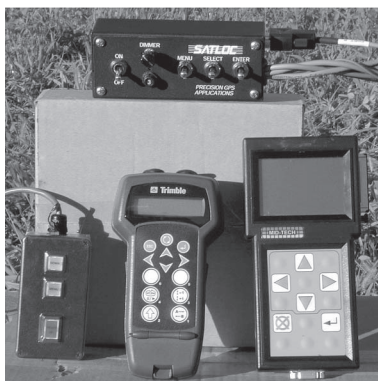
Figure 4. Controller and data logger.