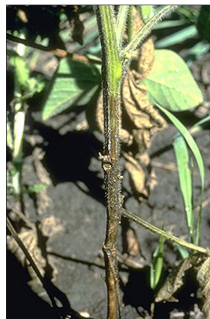
Figure 2. Phytophthora stem rot—adult plant showing stem discoloration.

Phytophthora can attack soybean plants at any stage of development. Symptoms in young plants include rapid yellowing and wilting accompanied by a soft rot and collapse of the root. More mature plants generally show reduced vigor and may be gradually killed as the growing season progresses. Foliar symptoms