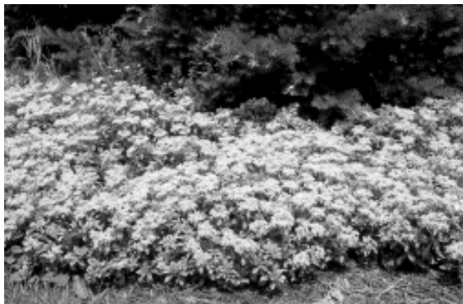
Sedum kamtschaticum , commonly called stonecrop, is ideal in full sun.