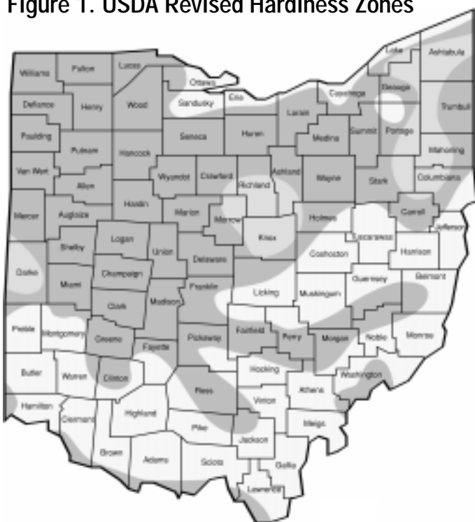
Figure 1. USDA Revised Hardiness Zones

Two to 3 inches of mulch will reduce evaporation of moisture from the soil and help reduce invasion by weeds. Well-aged bark, humus, cocoa bean hulls, pine needles, and shredded wood chips are organic mulch options.