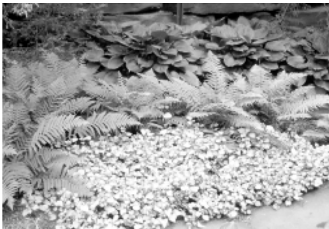
Three groundcovers are used together for a pleasing combination of heights, shades of green, and leaf size and texture. Hosta is in the rear. Athyrium thalyppteroides , commonly called silvery-glade fern is the feathery plant in the middle with Lamium maculatum , commonly called dead nettle, in the front.