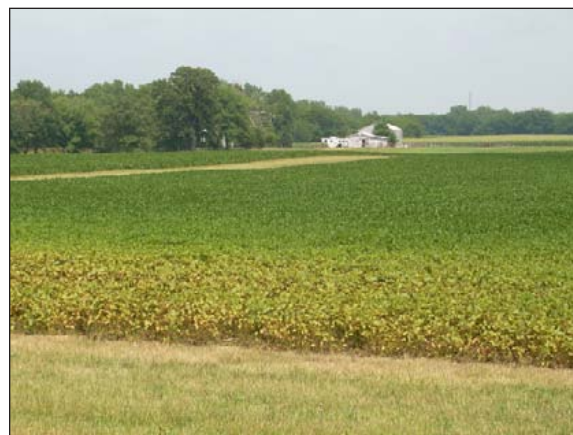
Figure 2. Mite injury on soybean field edge