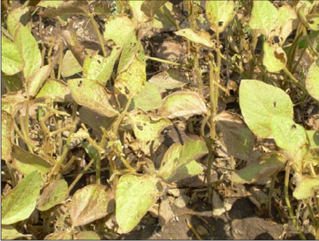
Figure 5. Soybean leaves showing bronzing and dying