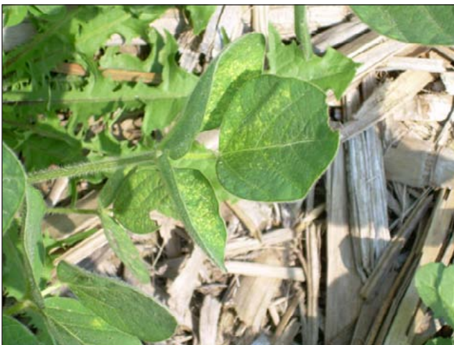
Figure 3. Soybean leaves showing speckling

In a year of a spider mite outbreak, when mite populations are widespread and rapidly multiplying, a field warranting rescue treatment may appear relatively green and healthy. Severely infested fields appear discolored and a potential yield loss may have already occurred due to a loss in vigor of plant growth. Heavily infested stands will exhibit a loss in plant stand.