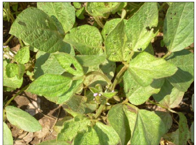
Figure 4. Soybean leaves showing yellowing