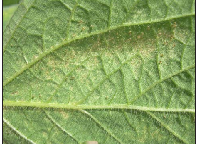
Figure 6. Underside of soybean leaf showing mites