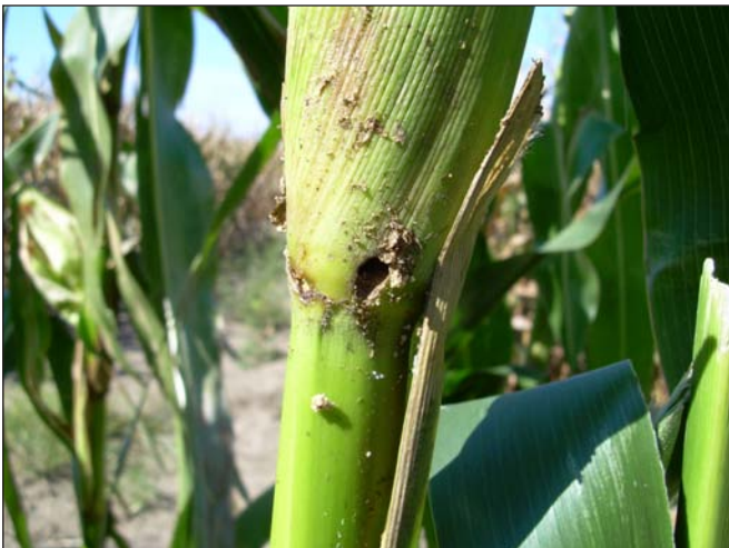
Figure 3. Larva entrance hole with frass

Assessment of second-brood injury in early September with an emphasis on evaluation of stalk quality and ear shank infestation (fig. 5) will provide relevant information on the need for scheduling timely harvest of corn stands that may be susceptible to significant ear drop or stalk breakage if harvest is delayed.