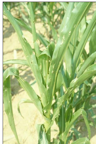
Figure 2. Larval leaf feeding injury

to deposit their egg masses on the underside of leaves of mid-whorl stage corn. Each egg mass appears like a small mass of fish scales and may include 15 to 20 eggs (fig. 1). The eggs hatch into early-instars that initially feed on foliage, causing window-pane injury, and on the tender central whorl, which subsequently leads to shot-hole injury in the emerging foliage (fig. 2). As the larvae become third- and fourth-instars (about 1/2-inch long), they tunnel into the mid-ribs and stalks. There they complete their larval development as fifth-instars and transform into pupae from which adult moths will emerge in midsummer. This larval generation, which occurs in the spring on whorl-stage corn, is called the first brood. During the period of larval development, significant proportions of larvae perish due to natural elements such as heavy rains or predation by beneficial insect predators. Although 15 to 20 larvae may emerge from a single egg mass, it is rare to find one or more mature larvae in a