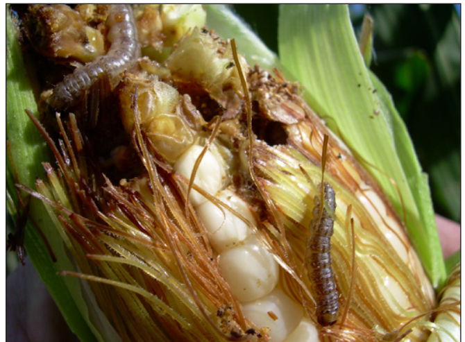
Figure 4. Corn cob tip feeding