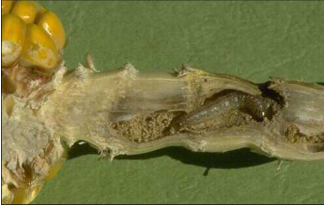
Figure 5. Shank injury