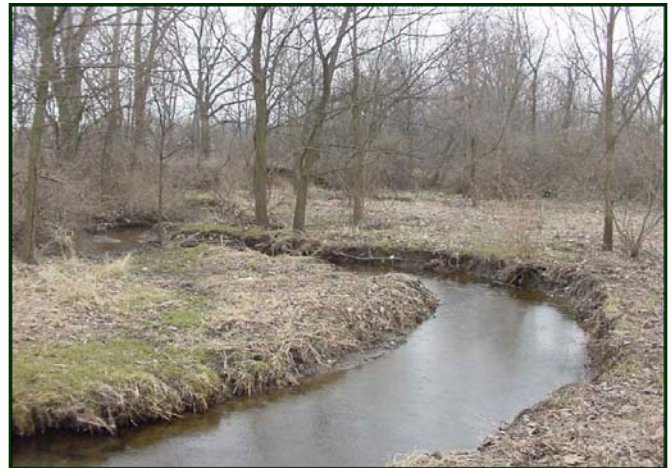
Figure 7. Rosgen Type E: W/D < 12 ; Sinuosity > 1.5 ; ER > 2.2 ; S < 2\%

Type E streams have a low width-to-depth ratio and exhibit a wide range of sinuosity (Figure 7). They are found in a variety of landforms. (Many meadow streams are Type E streams.) Generally they are very stable, in part because they have well developed floodplains with dense (often grassy) vegetation that helps to stabilize the near vertical banks.