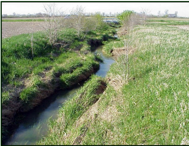
Figure 11. A modified channel that has formed an inset Type E channel at the bankfull elevation.

Overall, the Rosgen Stream Classification Method works well for midwestern streams. Almost any channel can fit into it and be classified, even if some landscapes are not described as well as they are typified by outliers. For example, there is not much useful description of Type Gc channels, but they do exist in the method. The method is useful in Ohio and has an ability to focus attention to the most important physical attributes of our streams: entrenchment ratios, width-to-depth ratios, and bed material classification. However, others might suggest a process-based classification, which gives insight to the balance of stream power and sediment supply, in order to quantitatively predict the future geomorphic condition of a stream rather than a form-based classification that qualitatively predicts relative condition 15 .