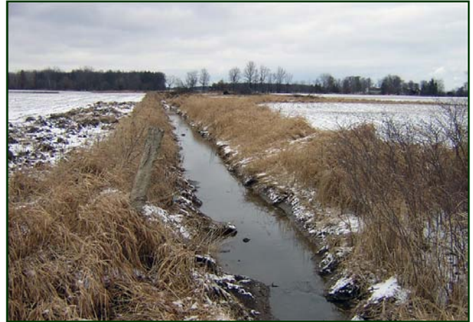
Figure 2. A typical modified headwater stream in the midwestern United States.

Stream order is an important characteristic of stream systems because it can be related to drainage area and stream size. An example of how drainage area and stream size are related to stream order for the State of Ohio is presented in Table 1 2 . More than 75% of the streams in Ohio are first- or second-order streams, which are considered small headwater streams less than 5 mi 2 . Many of the headwater streams in the Midwest region of the United States are constructed agricultural ditches or are natural streams that have been straightened and deepened to facilitate the removal of excess water from agricultural fields (Figure 2).