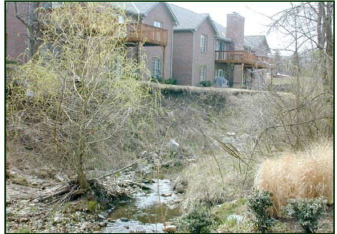
Figure 9. Rosgen Type G: W/D < 12 ; Sinuosity > 1.2 ; ER < 1.4 ; S < 2-4\%

Type C channels found in the virtually flat, lake plain soils areas of the Midwest exhibit a wide range of bed slopes with cohesive fine-grained (silt and clay) banks and beds. Type C streams in low gradient watersheds sometimes have a lower than expected sinuosity particularly in urban areas or settings where they have been modified. Many Ohio streams have the characteristics of a Type C except are classified as a Type E because of a low width-to-depth ratio. Additionally, misclassification of streams can occur as a