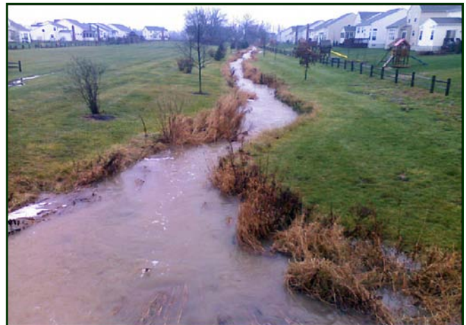
Figure 10. A first-order E stream in a suburban development in Ohio.

result of difficulty in determining bankfull conditions in unstable or modified systems that are constantly changing, or as a result of incorrect interpretation and analysis of bed and bank sediment sizes.