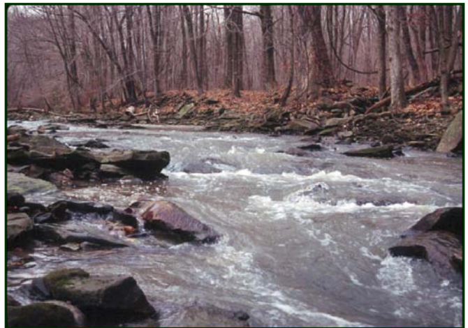
Figure 4. Rosgen Type B: W/D > 12 ; Sinuosity > 1.2 ; ER > 1.4-2.2 ; S 2–4%

Type B streams are typically moderately entrenched and less steep than Type A streams. They can be thought of as “babbling brooks” that are found in narrow valleys of rolling hill landforms (Figure 4). The channel bed consists of a series of rapids and cascades with irregular scour pools. The bed and banks are relatively stable, and they are sediment-supply limited systems. If available, large woody debris is an important component to in-stream fish habitat in these systems.