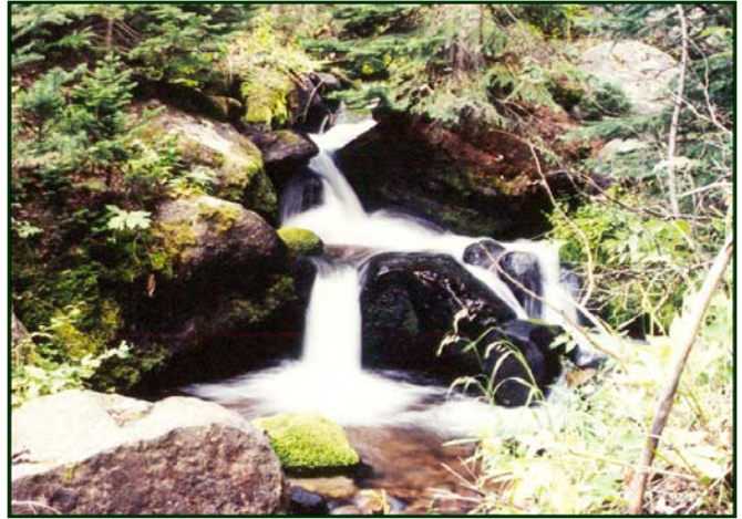
Figure 3. Rosgen Type A: W/D < 12 ; Sinuosity > 1-1.2 ; ER < 1.4 ; S 4–10%

Type A streams are typically steep, entrenched, and confined channels. They can be thought of as “mountain streams”. They range from A1 bedrock channels associated with faults, scarps, folds, and joints to A6 channels that are incised in cohesive soils. Type A streams have a step-pool or cascading bed form with boulder-, bedrock-, cobble- and, to some extent, gravel-bed channels (Figure 3). Bedrock- and boulder-bed channels are high-energy streams with a limited sediment supply whereas cobble- and gravel-bed channels are high energy with high sediment supply. Erosion, instability, mass wasting, and debris flow become more dominant processes as the bed material becomes finer (A3 to A5).