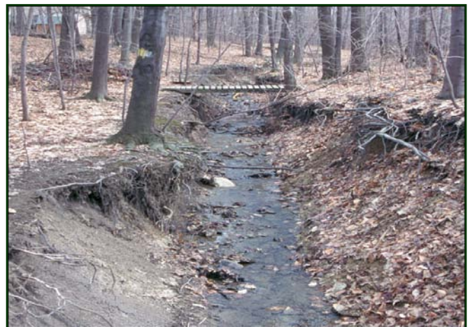
Figure 8. Rosgen Type F: W/D > 12 ; Sinuosity > 1.2 ; ER < 1.4 ; S < 2\%

Type F streams are meandering, entrenched, and highly incised systems in low gradient landforms. In these systems, top-of-bank elevation is much higher than bankfull elevation (Figure 8). Boulder and bedrock F channels are usually stable while gravel and sand-bed F channels can have high bank erosion rates and are often a failed or failing type C channel. In Ohio, Type F streams will not be in dynamic equilibrium.