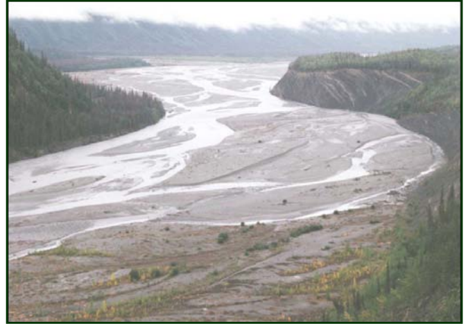
Figure 6. Rosgen Type D: W/D > 40 ; Sinuosity > 1.2 ; ER n/a; S < 2\%

Type D streams are multiple-channel, or braided, systems that typically do not have a boulder or bedrock channel bed; however, there are cases where localized bedrock control (such as a bedrock outcrop) results in the formation of a short braided reach. Braided channels (Figure 6) can occur across a wide range of morphological and topographic conditions. Alluvial fans in broad alluvial valleys, U-shaped glacial valleys, glacial outwash valleys, low relief alluvial valleys, and deltas are all common locations for Type D streams. With the exception of Type DA streams (wetland, marsh, or delta systems), these systems have high sediment supply and transport capability, so they typically have high sediment yields.