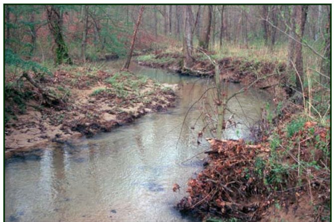
Figure 5. Rosgen Type C: W/D > 12 ; Sinuosity > 1.2 ; ER > 2.2 ; S < 2\%

Type C streams are slightly entrenched, meandering systems characterized by well-developed floodplains (Figure 5). They have a riffle-pool bed form and are typically wider than they are deep. These streams are stable and usually are sediment supply and transport limited. However, if they have gravel or finer bed and bank materials they are susceptible to scour, erosion, and meander migration. As the bed and bank materials become finer, a larger percentage of the sediment load will be suspended or wash load. Type C channels might occur up to bed slopes of 2 percent; however, valley wall confinement and the lack of a wide floodplain usually will force a Type A or B stream at steeper slopes.