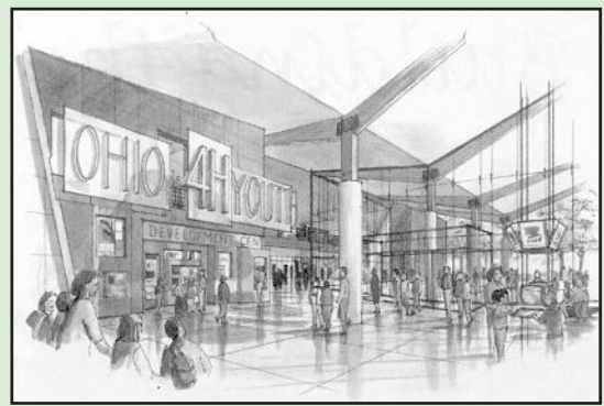
Artists rendition of the proposed Ohio 4-H Center

As 4-H celebrates its centennial, it is time to focus on youth and build a facility that will enable premier youth development programming on The Ohio State University campus. Be a part of "Building the Future." Ask your county OSU Extension office how you can get involved with building the Ohio 4-H Center.